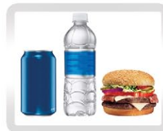
NO FOOD OR BEVERAGES