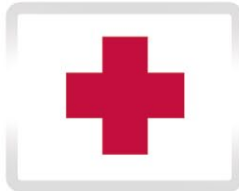
ITEMS RELATED TO A MEDICAL CONDITION

Halloween costumes may be worn at Camp Randall Stadium and the Kohl Center, but the costumes must be able to fit into a normal seating space and must be of an appropriate nature. No additional carry-ins will be allowed as part of a Halloween costume.