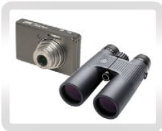
BINOCULARS & CAMERAS