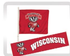
NO FLAGS, BANNERS, SIGNS