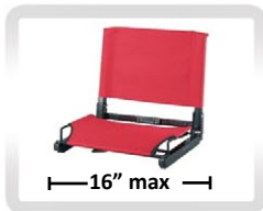
CHAIRBACKS not more than 16" wide