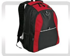
NO BAGS LARGER THAN 8.5" x 11" (INCLUDING BACKPACKS)