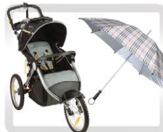
NO STROLLERS, NO UMBRELLAS