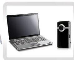
NO LAPTOPS, NO VIDEO RECORDERS