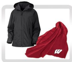
JACKETS & BLANKETS