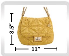
BAGS No larger than 8.5" x 11"