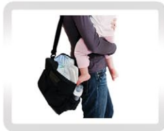
DIAPER BAGS WITH CHILD